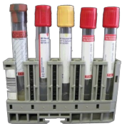
Roche Cobas®, Elecsys, Modular, Urisys & Integra Racks