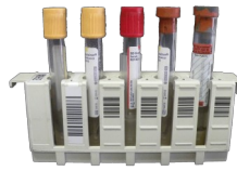
Abbott ARCHITECT System Racks