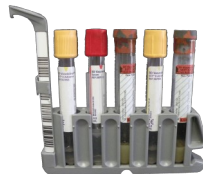
Siemens ADVIA Centaur System Racks