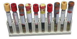
Sysmex Coagulation or Iris Urinalysis Racks

For more information, please call us, or visit us on the web