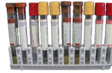
Beckman AU Chemistry or PK Blood Bank Racks